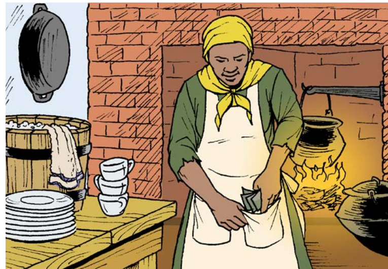
Even in the north, African-Americans were paid little.

To escape, Harriet walked 100 miles (160 km), alone, through unknown land. She traveled at night and hid during the day. Finally, she arrived at the border of Pennsylvania, a state where slavery was illegal. Harriet was free!