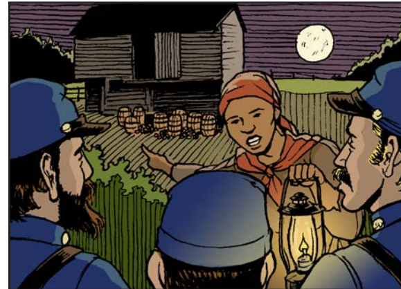
Harriet led Union soldiers to arms and ammunition stores.

On April 12, 1861, the Civil War began. The North and South fought each other over the right to own slaves. During the war, Harriet worked as a nurse for the North’s Union Army. She was also a spy, scouting out the Southern army’s weapon warehouses, and she continued to travel into the South to lead slaves north.