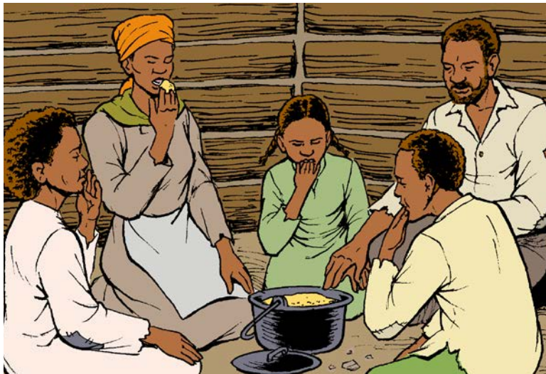
Harriet's entire family was forced to work without pay.

Harriet's great-grandmother was the human property of a man she called her master. All of her children and grandchildren were slaves, too. The slaves were forced to do hard labor and were punished cruelly at times. They received no pay, only meager food and housing that was no better than that of farm animals. Many of them were never taught to read and write. Slaves had no freedom to go where they wanted, and sometimes they were not allowed to marry or raise their own children. Members of slave families could also be sold to different masters, breaking up the family.