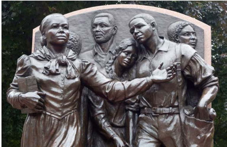
This is one of many memorials honoring Harriet Tubman.

Harriet helped many of her own relatives out of the South. Thanks to Harriet, six of her ten brothers and sisters escaped. On one difficult journey, she brought her elderly parents north to Canada.