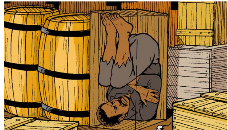
Henry "Box" Brown

Slaves went to great lengths to escape to freedom. Some shipped themselves north in boxes. One man, Henry "Box" Brown, nearly died during his escape when the box he was in was turned upside down for hours. Henry made it to Philadelphia, and freedom, after twenty-six hours in his box.