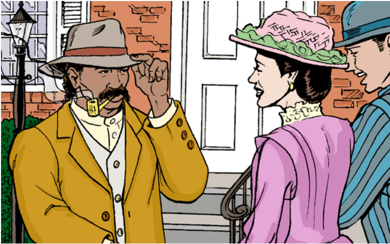
Harriet often disguised herself as a man.