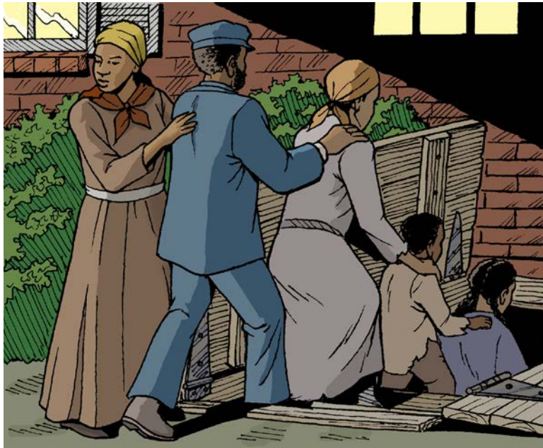
Harriet guided escaping slaves to safe houses.

Harriet made nineteen perilous trips back to the South, ignoring her own danger in order to become a conductor of the Underground Railroad. She guided escaping slaves from one safe resting place to another. A “station” on the Underground Railroad was usually an abolitionist’s home, or sometimes it was a church or another safe resting place. Some of the “stations” had secret rooms to hide the escaping slaves. Sometimes the slaves rode from place to place hidden under false bottoms in conductor’s carts.