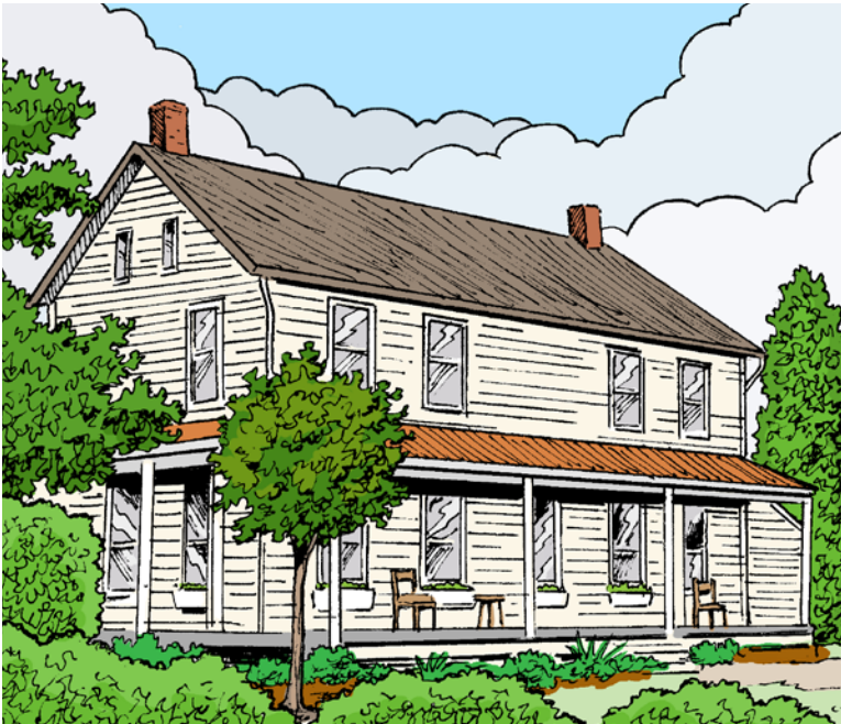
The Harriet Tubman Home housed elderly freed slaves.

Harriet Tubman died March 10, 1913. She devoted her long life to freedom. She will always be remembered as a true hero.