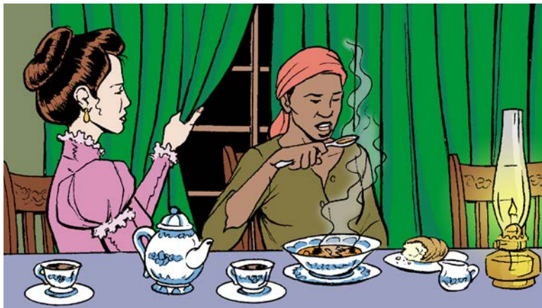
Abolitionists' help allowed Harriet to escape north.

Two nights later, Harriet escaped alone. She went to the home of an abolitionist woman who had offered help. The woman fed Harriet and let her sleep, and then she directed Harriet to the next safe place. When Harriet reached that house, the people there directed Harriet to her next stop. This secret network of safe homes was called the Underground Railroad .