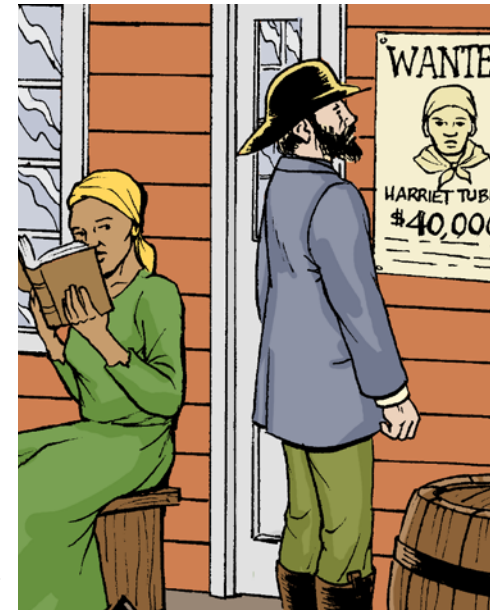
Even with the reward, no one turned Harriet in.

Slave owners were furious, and they offered a reward for Harriet’s capture, dead or alive. The reward was $40,000—an enormous amount of money for those days. One day, Harriet overheard a man reading her own wanted poster, which described Harriet as not being able to read. She immediately pulled out a book and pretended to read it, and the man left without giving her a second look.