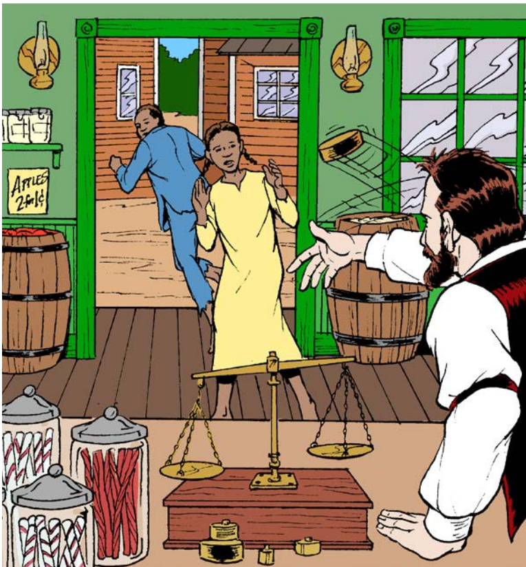
The weight left Harriet with a large scar on her head.

When she was a young girl, Harriet tried to help an escaping slave. The slave's master threw a metal weight at her, and it struck her in the head. Harriet almost died from the wound on her forehead. For the rest of her life, she had headaches and sleeping spells because of her injury.