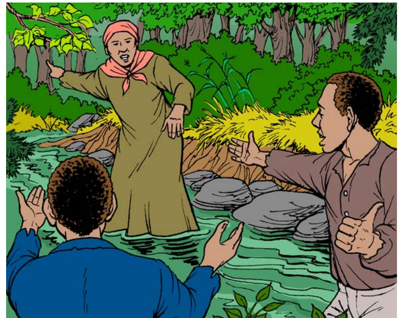
If Harriet had continued, her brothers may have been tortured into revealing where she was going.

One day, Harriet's owner died. Harriet knew the slaves would be sold; it was time to go. Harriet and two of her brothers ran away, but soon after they left, the brothers gave up, forcing Harriet to return with them.